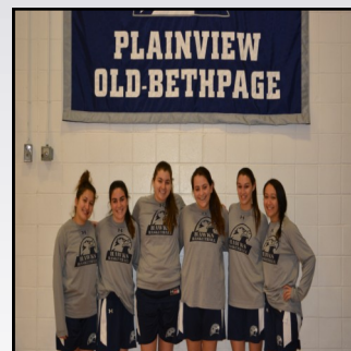
The Girls Basketball team had its most successfully season in years.

The ACSL program is brought to us by Hofstra University School of Medicine and the Louie Acompora Foundation