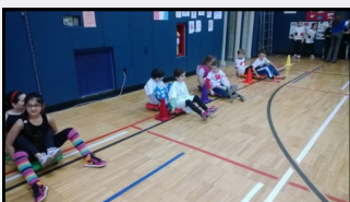
3rd graders on the starting line in the 2-man bobsled event at Stratford Road.