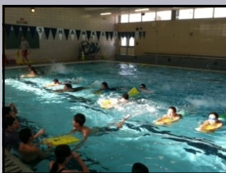
POBMS students enjoying a swim in mid-January.

Thank you to all of the teachers involved and all of the students who participated.